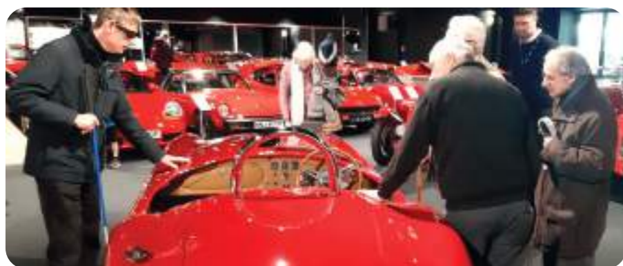
Photo of Red car at Haynes Motor Museum