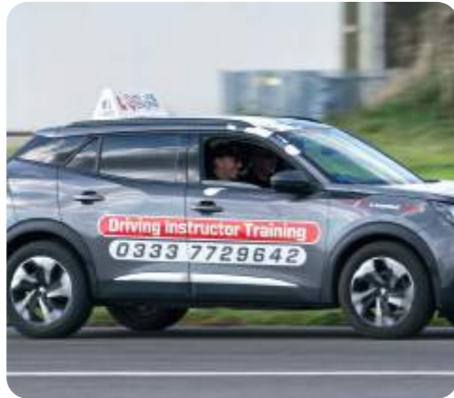
Photo of Car Driving

My driving experience at Henstridge was amazing as it gave me the freedom to do something I will never do.... drive...and at really fast speeds which felt really good and I felt free which is something I don't