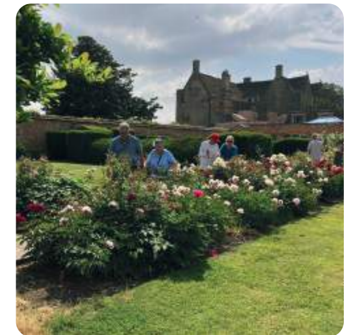
Photo of North Cadbury Court Gardens