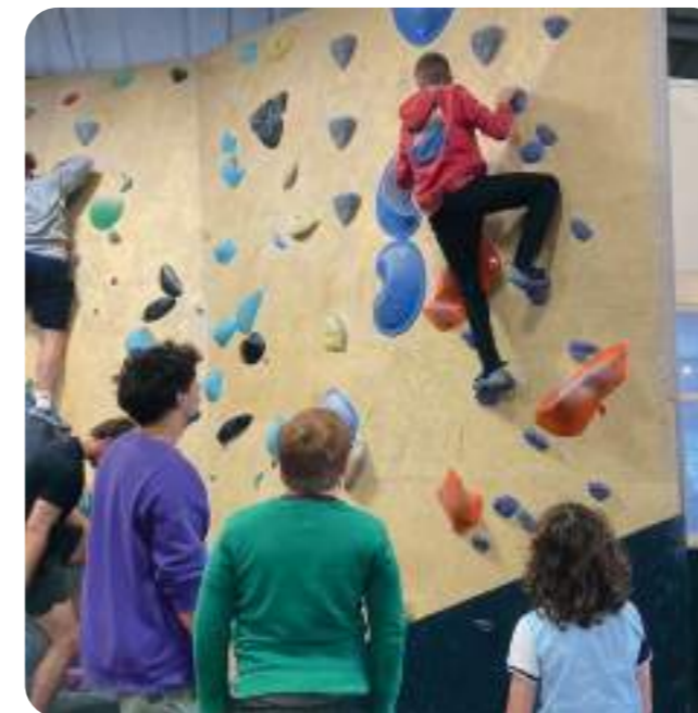
Photo of Child climbing boulder wall