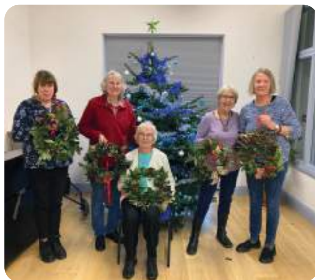
Photo of Group with Christmas Wreaths