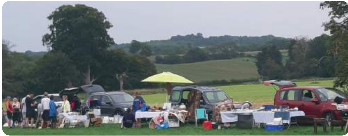
Photo of Yarlington Country House Car Boot Sale

This year's Yarlington event hosted 30 stalls and several classic and vintage vehicles. The weather was against us but we still raised more than we did in 2019 which is an amazing achievement. Over £3500.