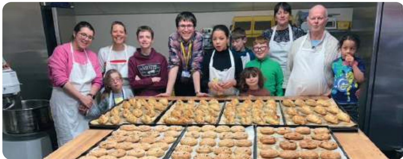
Photo of Burns the Bread participants with Eccles cakes and Cornish pasties.