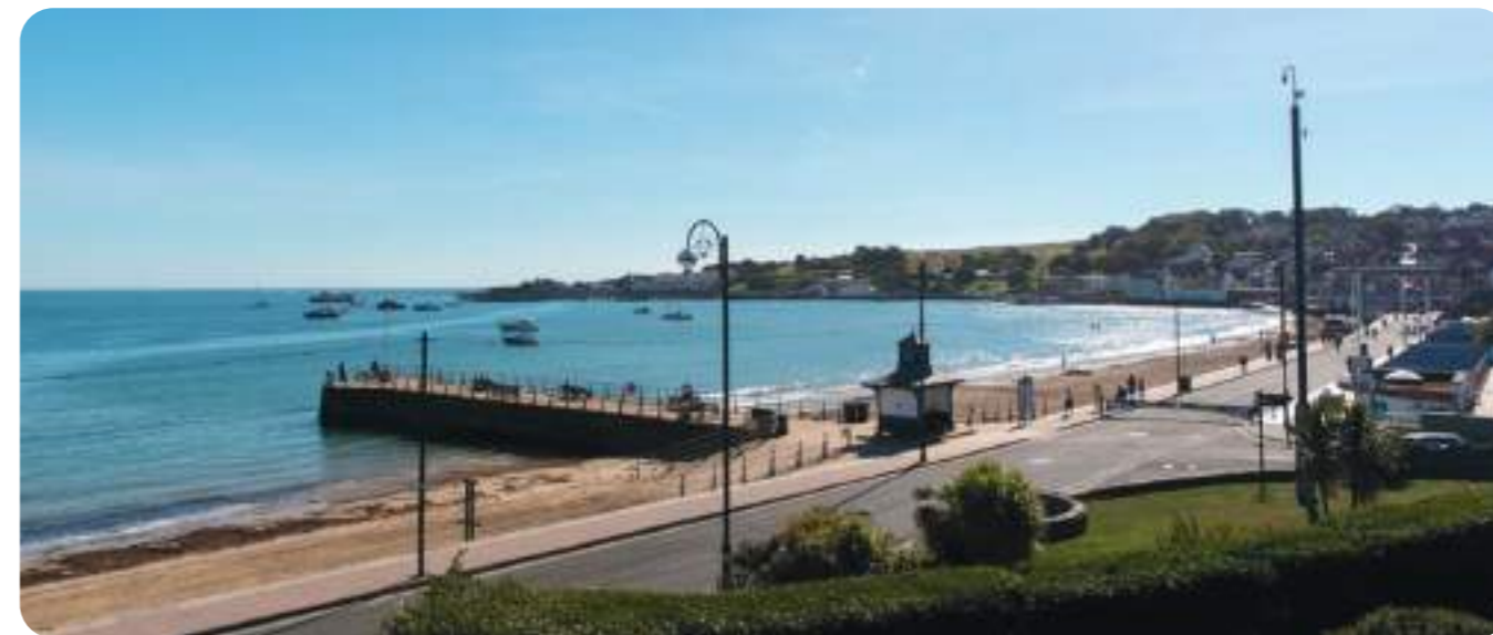
Photo of Swanage Seafront

Westlands Entertainment venue on the first Monday of the month, between 10.0am to 12pm, a group of lively and friendly people meet for the Yeovil Social group. They chat over coffee or a drink and arrange trips out. During 2023 they visited the Fleet Air Arm museum, Bovington Tank museum plus seaside trips to Swanage and Weymouth.